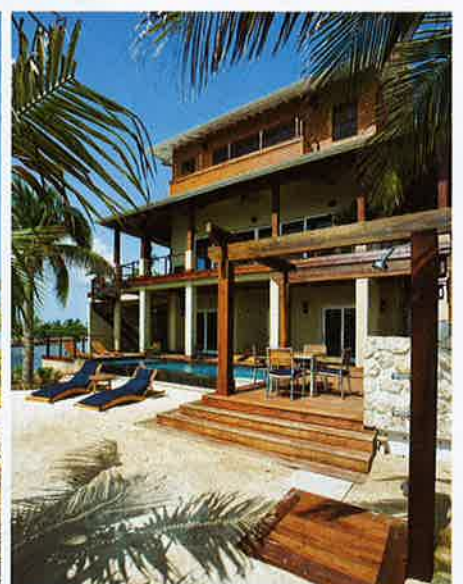
TOP: SPACEARIUM. BOTTOM: DECKHOUSES